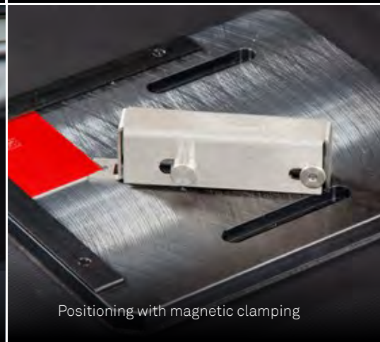
Positioning with magnetic clamping