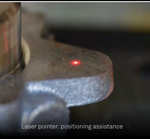
Laser pointer: positioning assistance