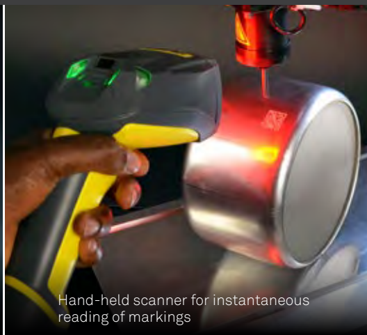
Hand-held scanner for instantaneous reading of markings